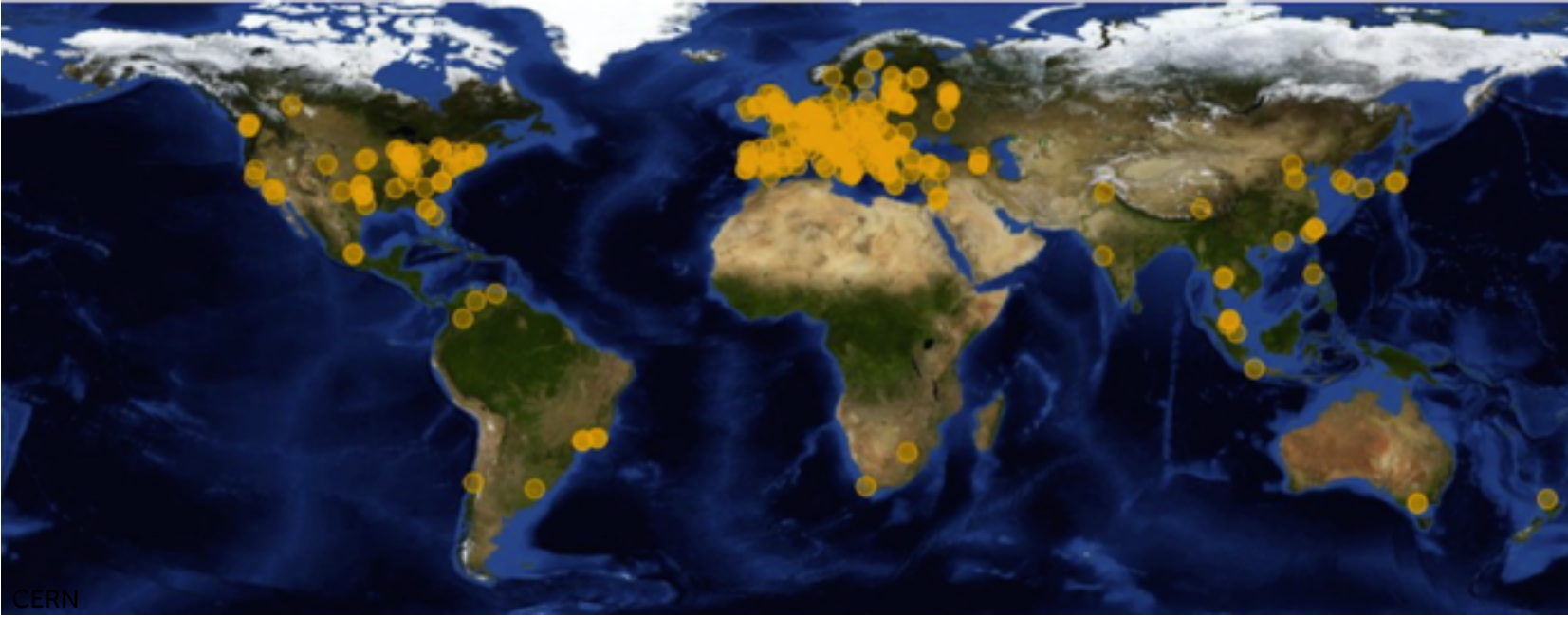
CERN's Worldwide LHC Computing Grid is made up by 170 data centers in 42 countries.

Its invention of grid computing technology, known as the Worldwide LHC Computing Grid , has allowed it to distribute data to 170 data centers in 42 countries in order to serve more than 10,000 researchers connected to CERN.